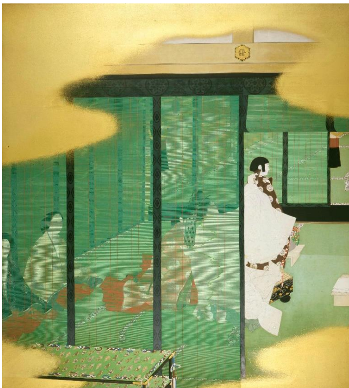
THE RITES OF GROWTH Artist : KITANO Tsunetomi • Japanese painting