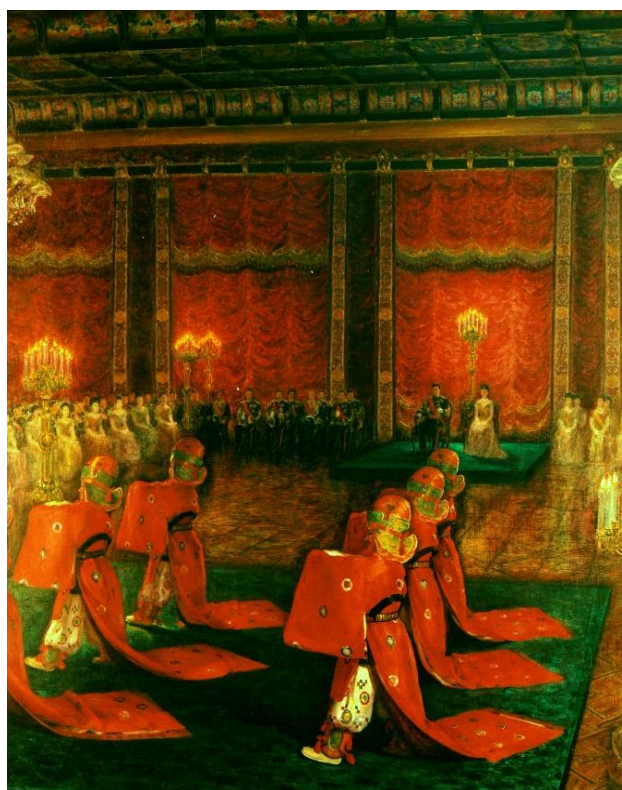
SILVER WEDDING ANNIVERSARY OF THE EMPEROR Artist : HASEGAWA Noboru • Oil painting